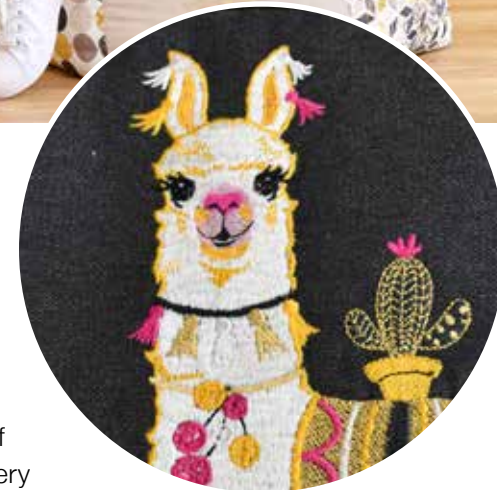
Variety of embroidery designs included